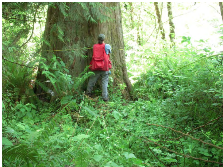
Old growth western red cedar, Jacoby Creek Forest