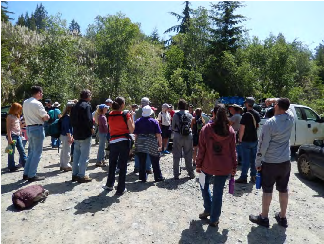
Preparing for Jacoby Creek Forest canyon public hike