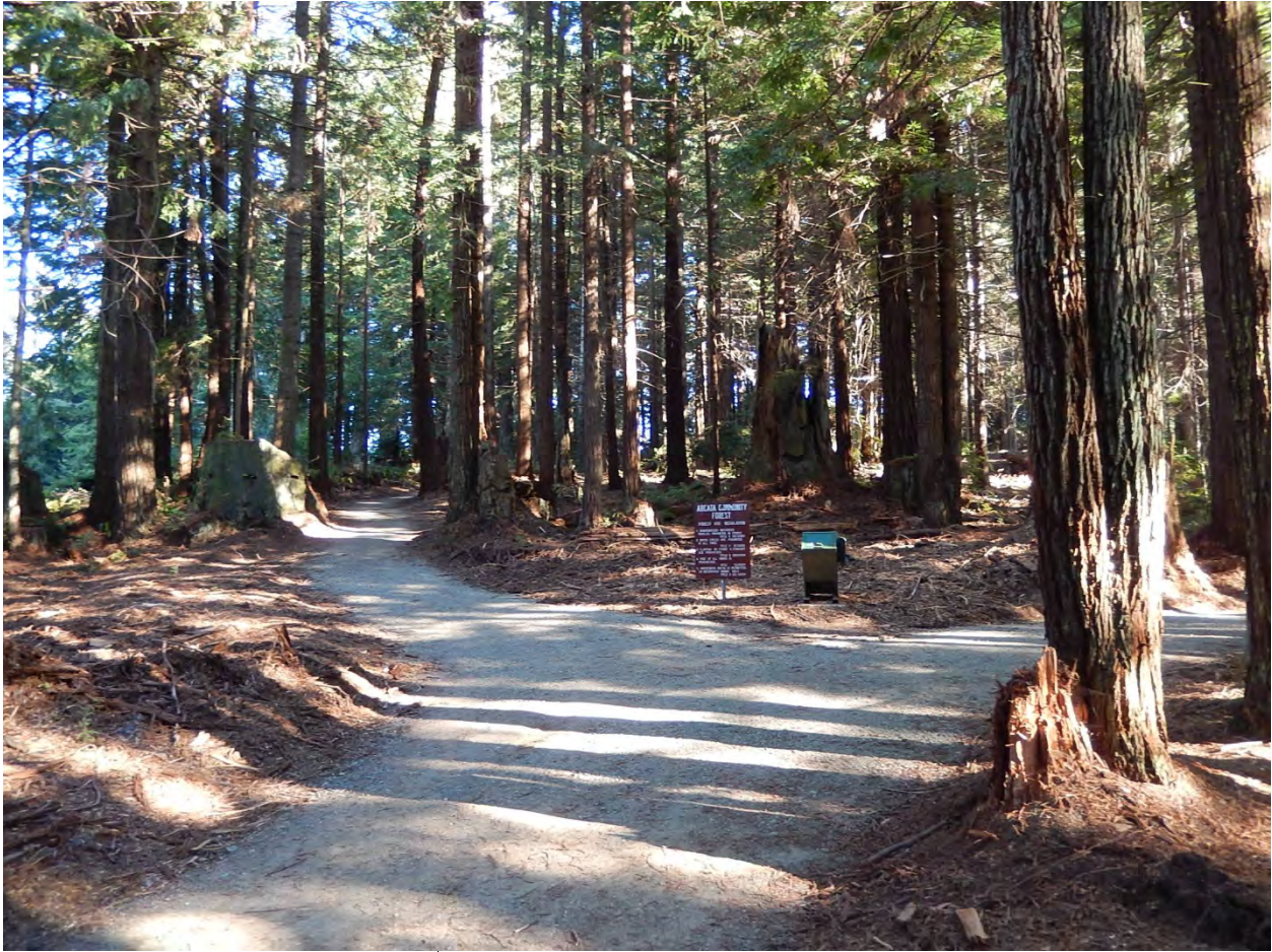
Extensive road rock applied to previously un-rocked road surfaces in the ACF near Diamond Dr.