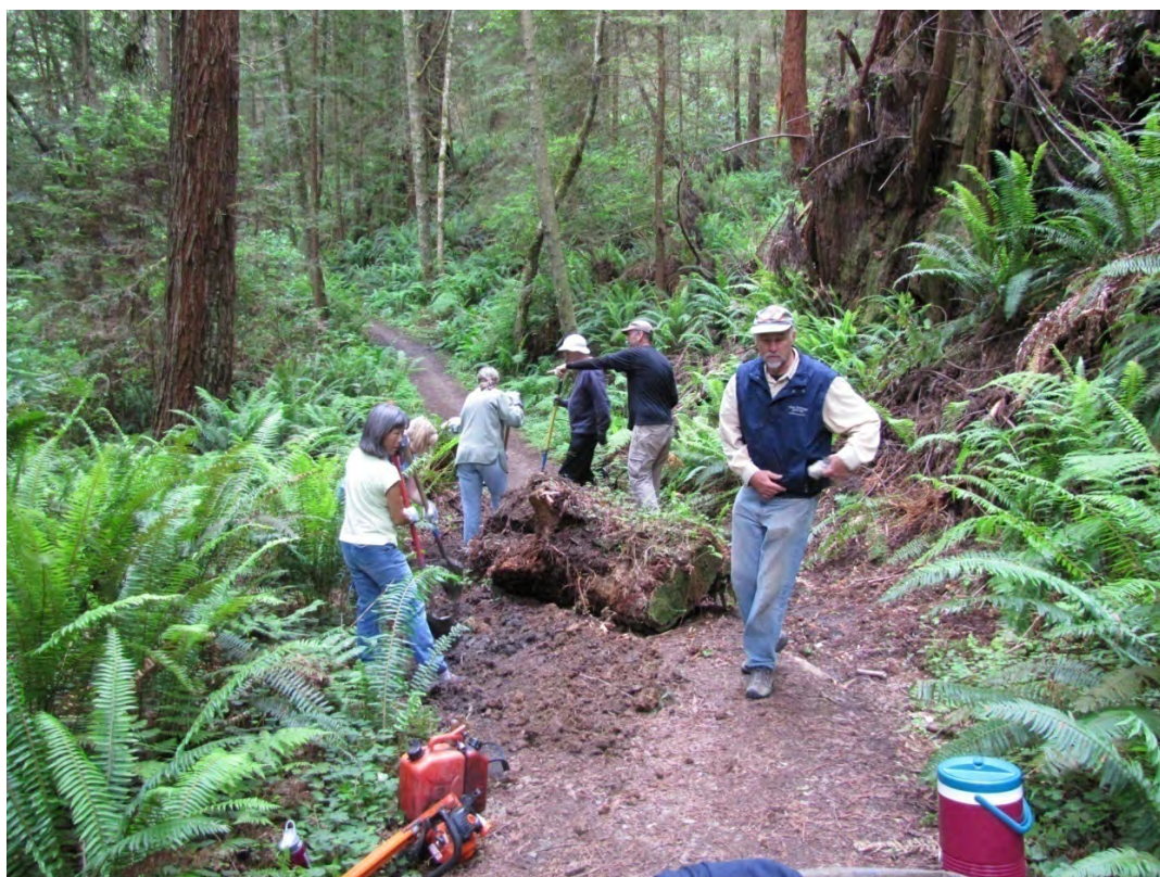
Volunteer trail work day in the ACF.