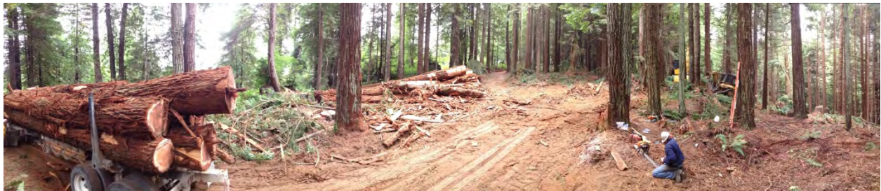
2014 timber post harvest view (top) in progress (bottom) Trail # 5, Arcata Community Forest