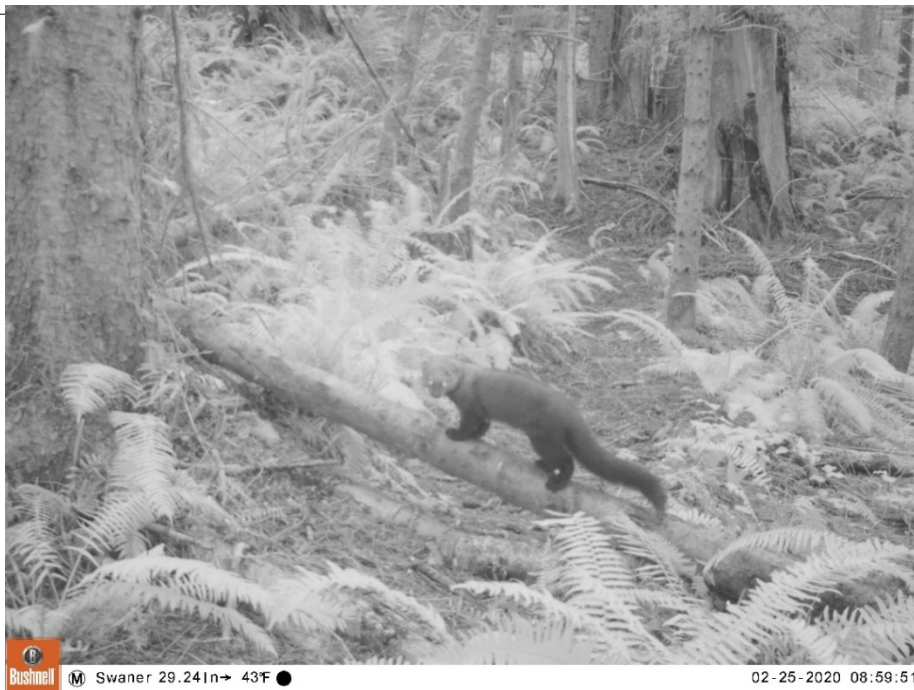
Pacific fisher on the Swaner parcel being added to the JCF 2020.