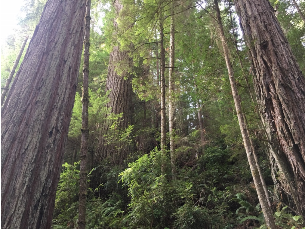
Old growth trees south slope in the Jacoby Creek Forest near Greenwood Hts. Rd. Periodic visit to long-term continuous forest inventory plots.