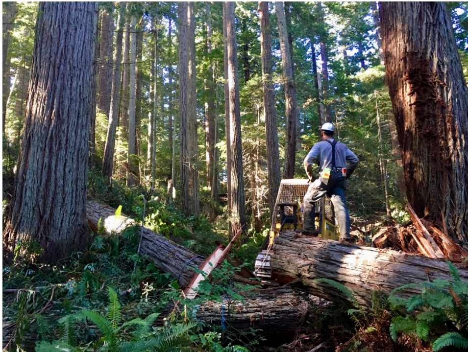
ACF 2019 timber harvest. Redwood Forest Product Inc.