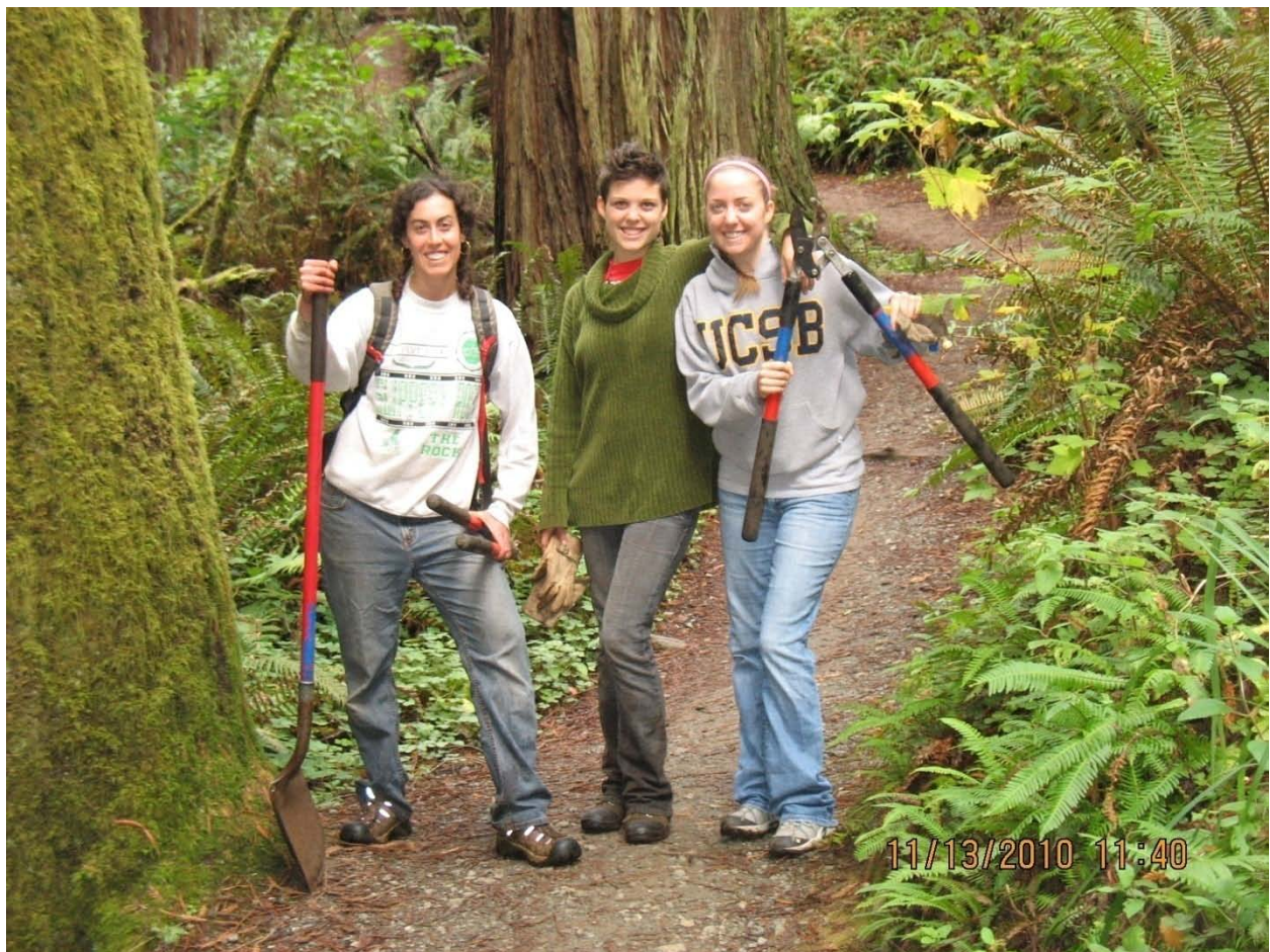
Arcata Community Forest Work Day volunteers Fall 2010

The following information is a summary of the various activities of the Forest Management Committee (FMC) during fiscal year 2010/2011.