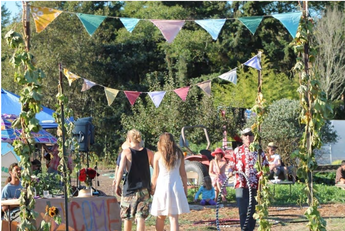
Bayside Park Farm Celebrates 20 Years