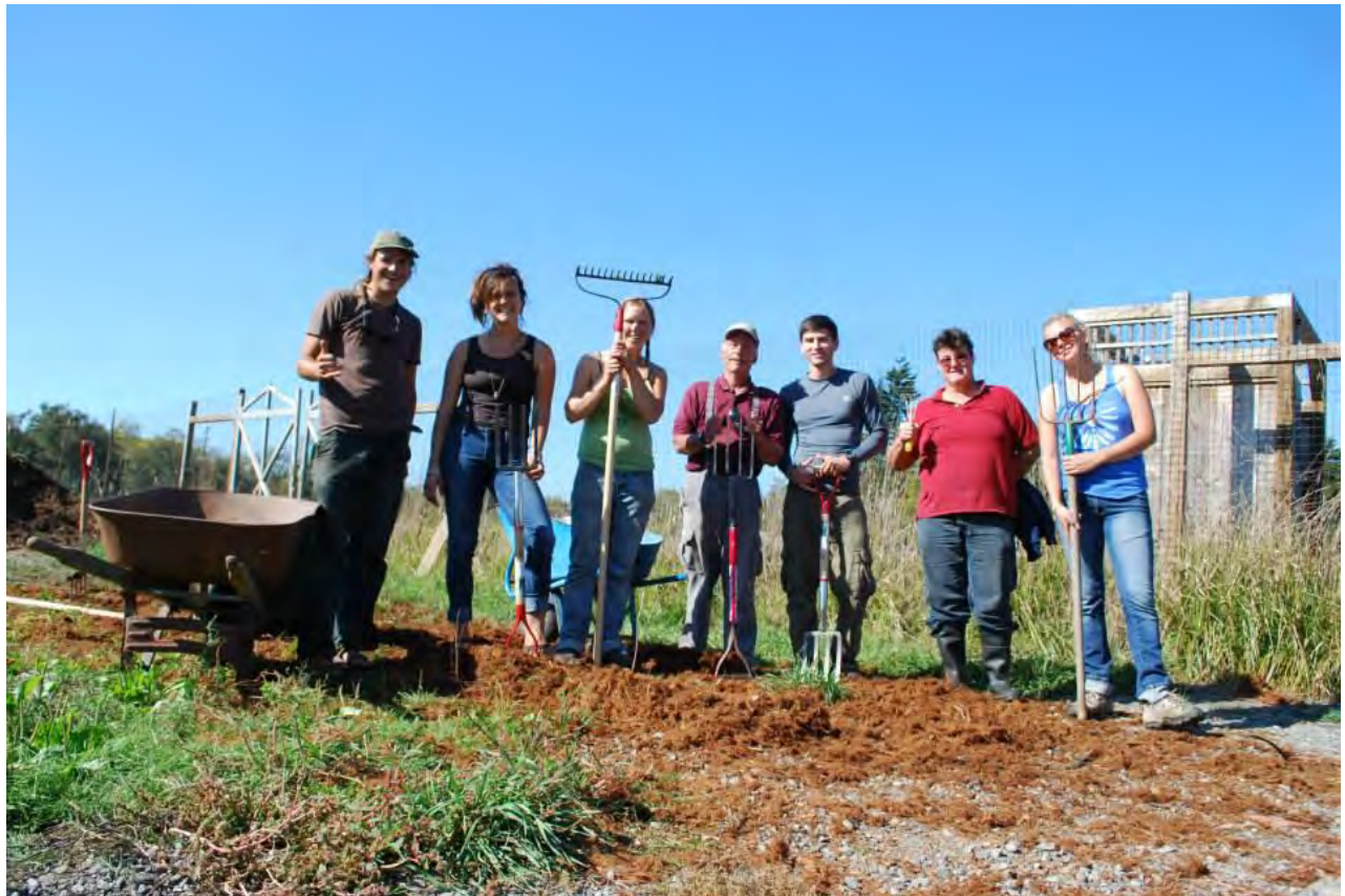
Bayside Park Community Garden Pathway Project

In 1968 the Arcata Recreation Commission became the Parks and Recreation Commission, an advisory body to the City Council. In 1976 a full-time Recreation Department Director was hired and in 1977 the Parks Department combined with the Recreation Department to form the Parks and Recreation Department. Due to financial constraints, the Director position was cut from the 1993/94 budgets. At that time, the Parks Superintendent began reporting to the Public Works Director. The Recreation Division Manager reported to the City Manager until November 2000 when the Recreation Division was incorporated into the Environmental Services Department.